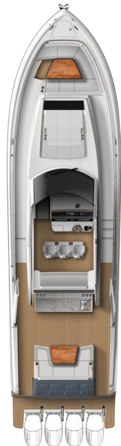
Summer Kitchen on aft bulkhead